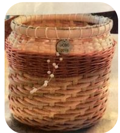
DCBG's 30 th Anniversary Basket