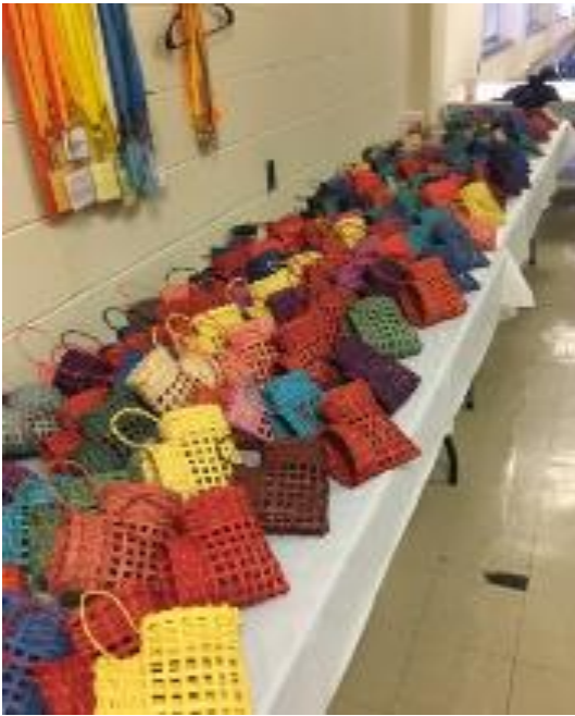
Deer Heart Door Prize Baskets