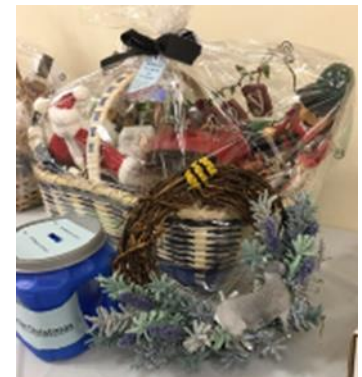
Bingo Raffle Basket

Bingo sales totaled $1,638.00. Profit from the Bingo will be used to promote the Guild and its endeavor to perpetuate the art of basketry. Successful Bingos would not be possible without the many members who volunteer to weave baskets, setup, work the various jobs the day of the Bingo and clean up. Thanks to our